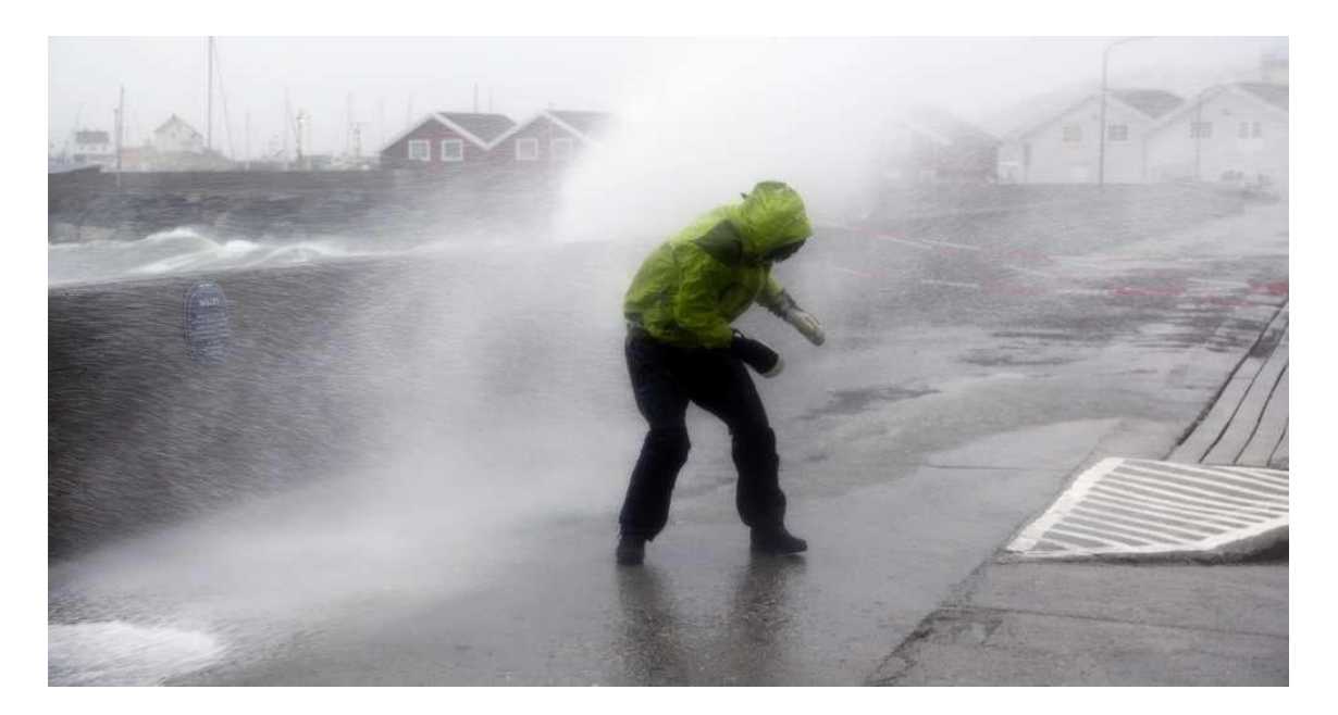
Figure 1. There have always been severe weather phenomenon, however, a change in the system pattern is changing the climate in Northern Europe regions.