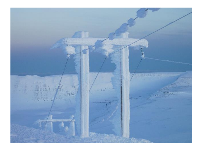
Figure 5. Icing is a severe challenge mostly on infrastructure.