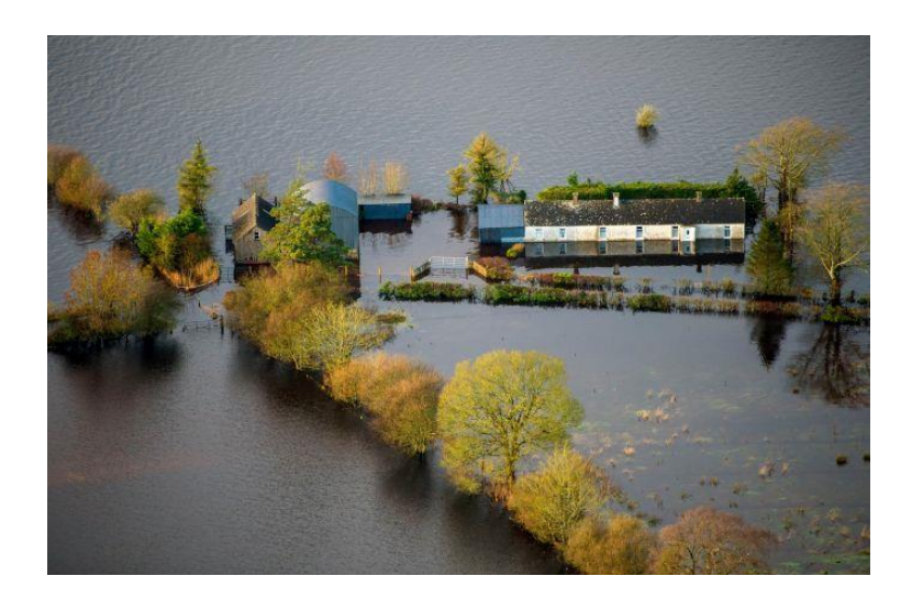
Figure 4. The flooding results often in severe infrastructural challenge and the recovery takes a long time. This will have major impact on the local business. Image shows flooding along the banks of the river Shannon near Athlone.