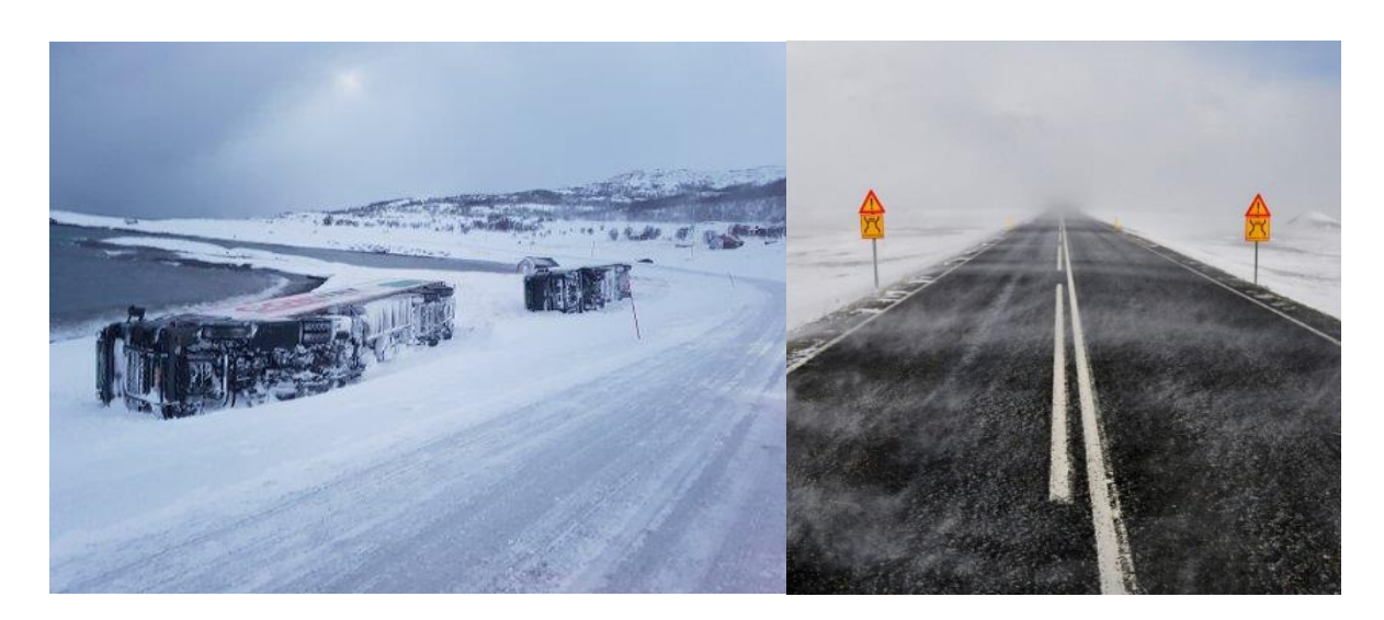
Figure 3a (left). Two trailers are blown over by the wind.