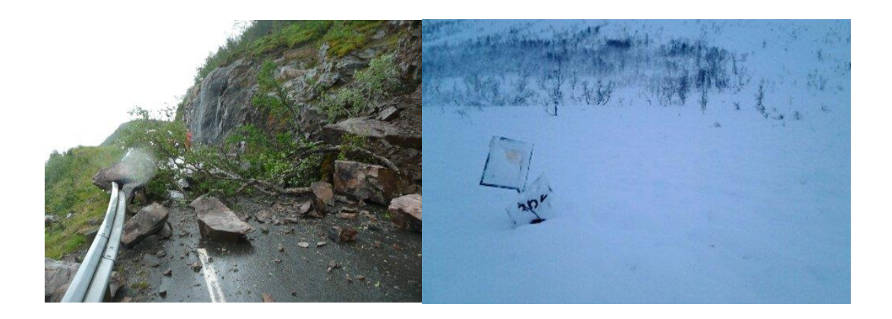
Figure 2a (left). A closure of the road close to the city of Harstad in Norway. A boat temporarily replaces transportation between the city districts.

Figure 2b (right). The road located many metres below the sign due to an avalanche in Troms Norway.